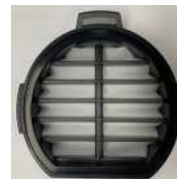
<HEPA Filter (13 degree) >