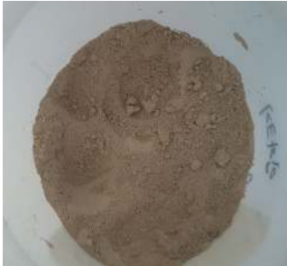
< Dust for Test Use >