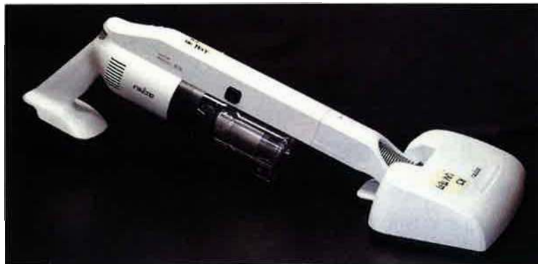
Figure 1. Specimen