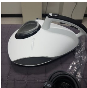
< RTP MAIN BODY >