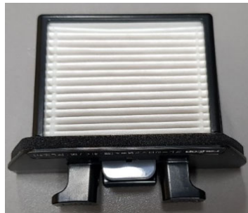
< HEPA Filter >