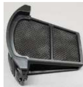
< Fabric Filter >