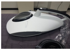
< RS3 MAIN BODY >