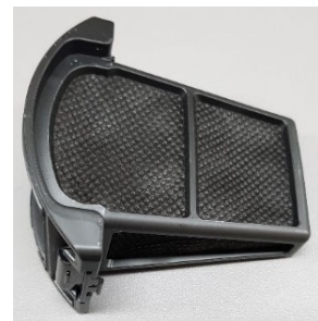
< Fabric Filter >