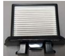
<HEPA Filter (13 degree) >