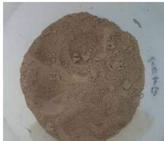
< Dust for Test Use >