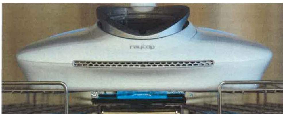
Picture 2. Appearance of UV irradiation